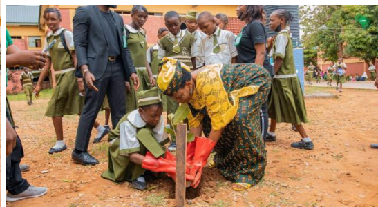
Cross-section of the Principal and the 2 current Vice Principals of JS, Area 11, Garki engaging in the Planting activity.