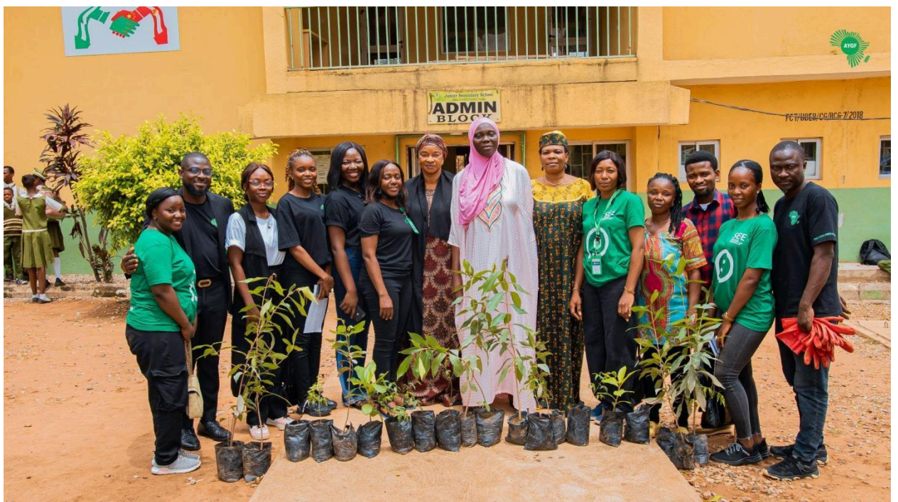
Photo of AYGF Programs Staff, with Staff of PFSEE and the Management of JSS, Area 11, Garki.