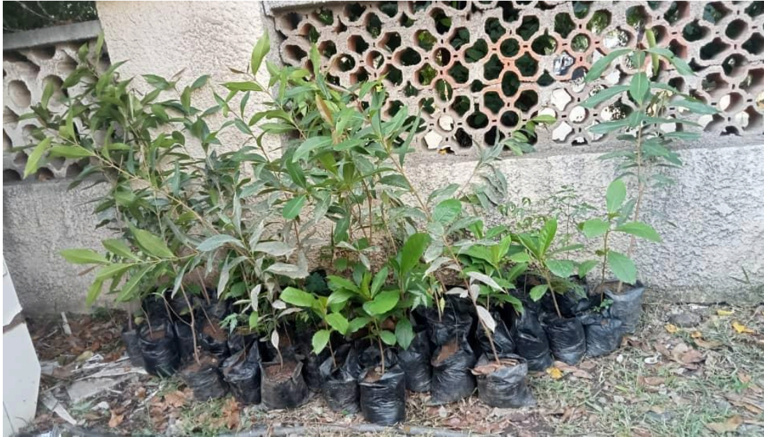
The 50 trees donated by Prinrite Foundation for Sustainable Environment and Education (PFSEE)