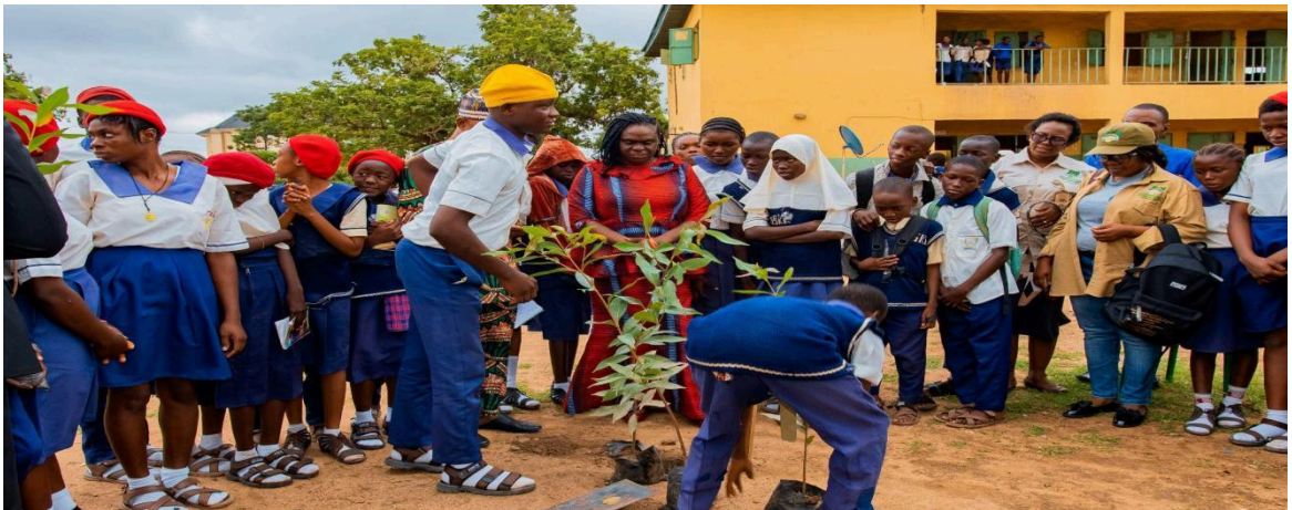
Cross-section of Tree Planting Activity in Kado-kuchi